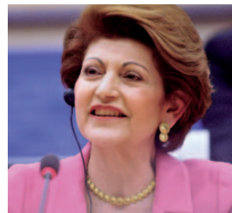
Androulla Vassiliou Commissioner in charge of Education, Training, Culture and Youth

I hope these stories will inspire students and higher education institutions alike to make the most of the opportunities available through Erasmus; the more we use and improve Erasmus, the closer we get to our goal of harnessing the benefits of learning mobility to give every young European a flying start in life.